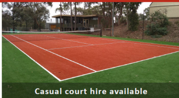
Casual court hire available

Located in beautiful Research Park we have 6 synthetic grass surface courts and BBQ facilities for member use.